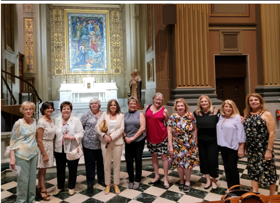
Alumni from the Class of 1972 attended the Baccalaureate Mass for the Class of 2022.

Don't miss out on information about your reunion, update your contact information on the Stay Connected page of The Millay Club website.