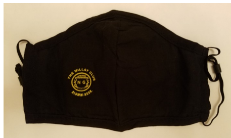
COVID-19 mask with The Millay Club logo given as a thank you gift to alumni who pay their 2021 membership fee.

supplies last. More information about the membership fee can be found on the Home page of our website, www.themillayclub.org